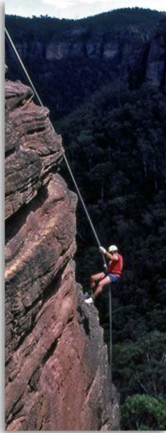
Rappelling in Oz