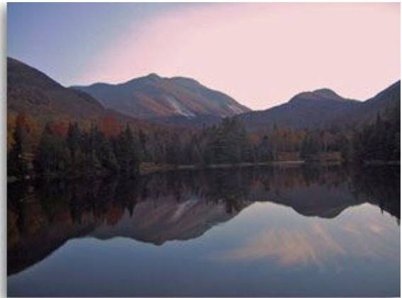
Still waters at dawn

If you are accompanied by friends or family, who will not be involved with one of our programs, you may prefer to stay in the village of Lake Placid. There are many attractions for children and adults nearby including the world-class Winter Olympic facilities (see Activities For Family & Friends ). There are also many restaurants and shops in the village. In good weather it takes about 20 minutes to drive from Lake Placid to Keene.