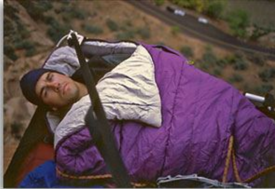
Great view, but...

Located on the eastern edge of Lake Placid, about 18 miles from us, this motel offers an indoor pool, hot tub, guest laundry facilities and game room. Rates: $150 and up (vary significantly with season).