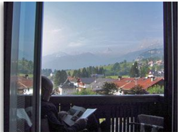
A comfortable room is most welcome after a long day in the mountains

From undeveloped campsites to luxury hotels, there is a wide range of accommodations to suit any preference or budget. Bed & breakfast establishments, motels, hotels, and cottages are conveniently close and abundant. Accommodations during our overnight trips are in mountain campsites.